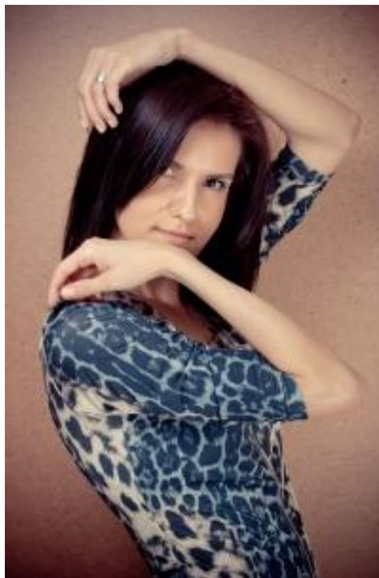
Image is almost always a dominant factor in confidence, therefore having a good image in the form of a healthy and attractive body, will automatically boost the self-confidence levels of the individual. The connection between the way in which the individual perceives his or her body conditions definitely plays an important role in the confidence exuded.